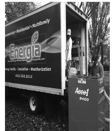
Energía truck at a residential project site.