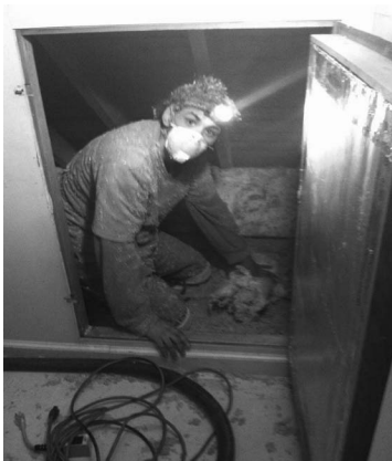
Installation work by Energía worker.

"It's exciting how much growth is happening. We started with two employees and we currently have 17."